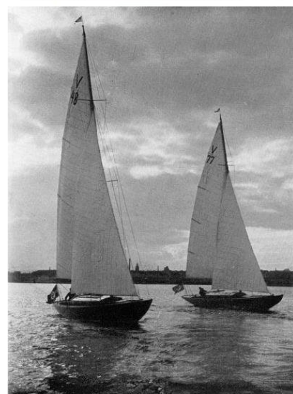
50 Square Metres similar to Hiltgund before the Second World War

It is believed that she was stationed at the Royal Naval Barracks at Portsmouth in the 1960s where she was possibly used by the Royal Marines and known as Sea Victor under which name she continued until 1996 when she returned to her original name Hiltgund .