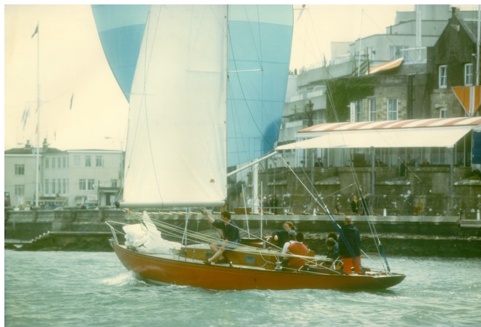
Below: Hiltgund on Loch Fyne.

on Loch Fyne and the CCYC Round Shuna Race as well as cruising between Northern Ireland and Skye. In recent years she has been based at Ardfern Yacht Centre during the summer and wintered at Crinan Boatyard.