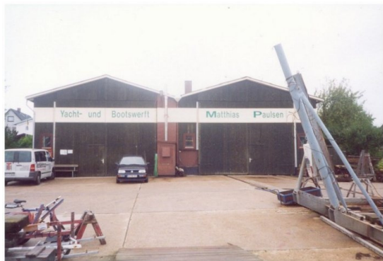
The yard where Hiltgund was built

A 50 Square Metre “windfall” yacht aka Pegasus and Sea Victor - Sail number V85